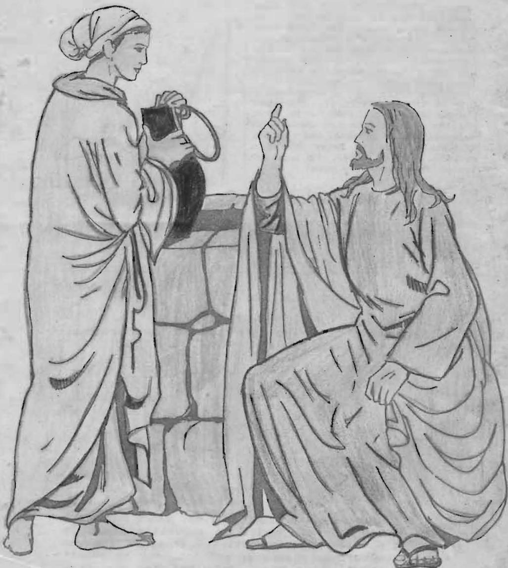
THE WOMAN AT THE WELL